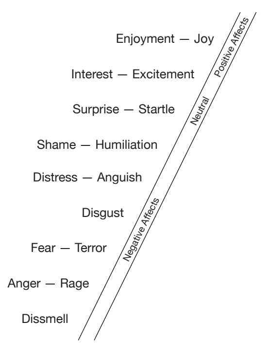
Figure 3. The Nine Affects (adapted from Nathanson, 1992)

require more planning and time, and are more structured and complete. Although a formal restorative process might have dramatic impact, informal practices have a cumulative effect because they are part of everyday life.