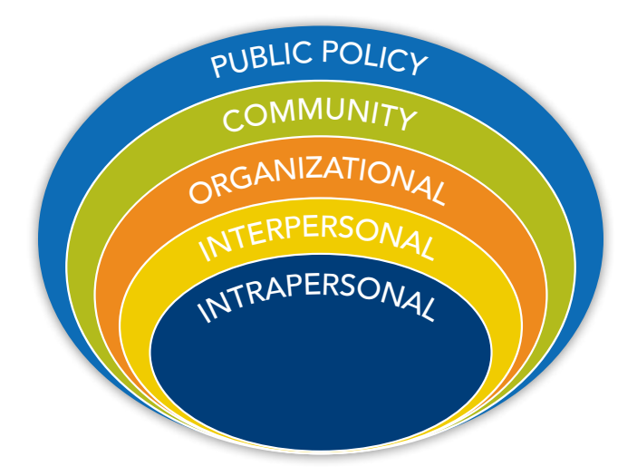
FIGURE 1: Social-Ecological Model, adapted from McLeroy et al., 1988

This can be a useful guide for exploring the factors impacting a community problem and then identifying potential solutions. A combination of prevention activities—working together across all levels of the social-ecological model-can provide a structure for community health efforts to be successfully implemented and sustained. Of course, these nested influences exist within the greater context of the planet and ecosystems that make human life possible. In fact, the World Health Organization recently named planetary health as "the highest attainable standard of health, wellbeing and equity worldwide through judicious attention to the human systems—political, economic and social—that shape the future of humanity, and the Earth's natural systems that define the safe environmental limits within which humanity can flourish" (WHO, 2021, p. 8).