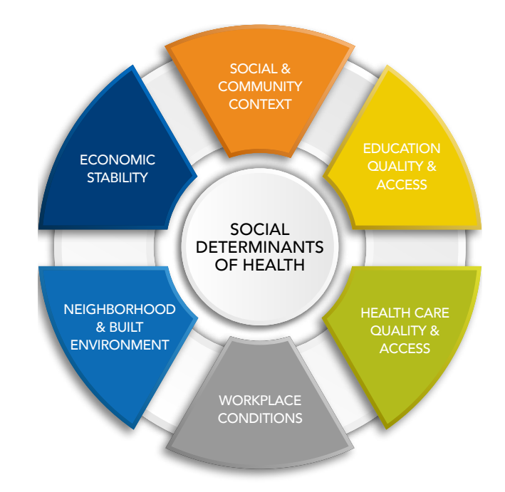
FIGURE 2: Social Determinants of Health, U.S. Department of Health and Human Services, Office of Health Equity, 2022